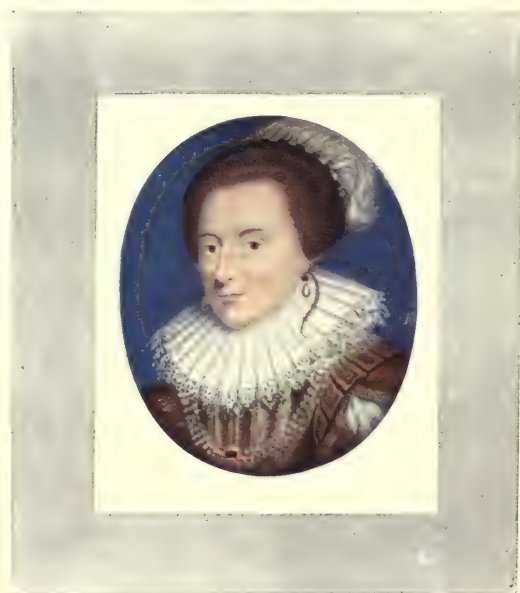
THE QUEEN OF BOHEMIA BY ISAAC OLIVER